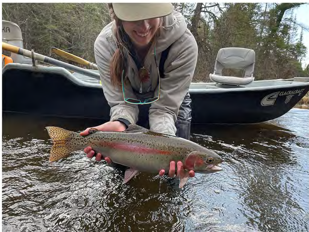
Kim with an awesome spring 'bow

Simms W's Bugstopper Legging Mosquitoes suck, black flies bite...These leggings offer the same protection we all have come to trust from Bugstopper technology, and are perfect under-wader wear. S-XL. Woodland Camo Avalon. $99.95